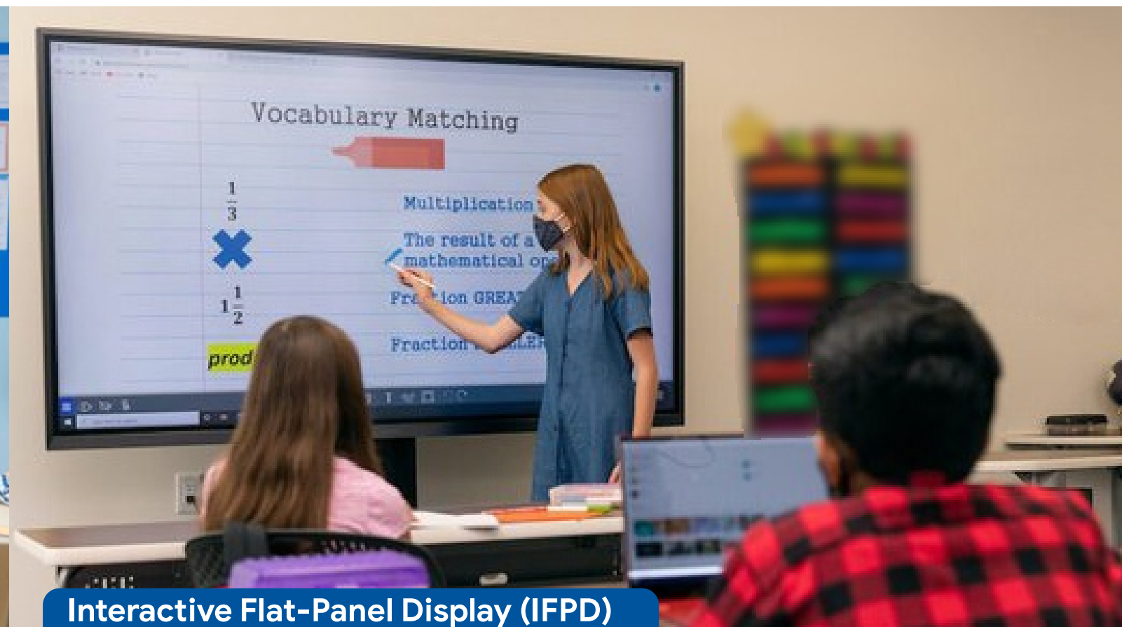
Interactive Flat-Panel Display (IFPD)

1. Advanced Technology: IFPs are equipped with a powerful inbuilt CPU (Central Processing Unit) T972A55*4/RAM-4GDDR/ROM-32G/ANDRIOD9.0, enables advanced processing capabilities. This processing power allows for smooth and seamless interactions with content and applications, making teaching and presentations more efficient.